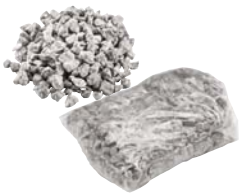
Special Granulate 1500 g Item No. 21824