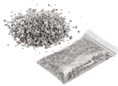
Special Granulate 500 g Item No. 21823